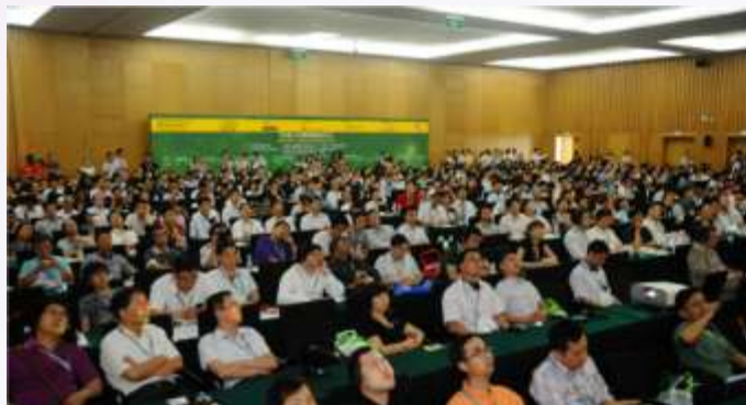
Light + Technology