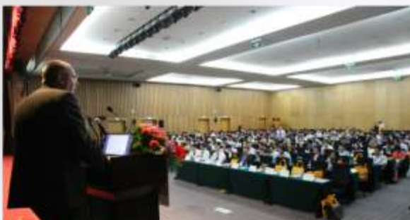
Light + Market