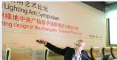
Light + Design