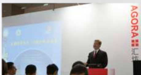
Light + Network